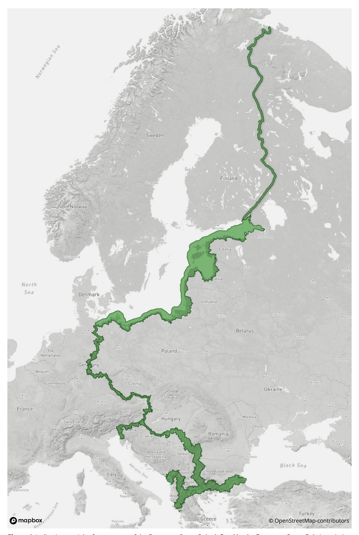
Figure 1: Indicative spatial reference area of the European Green Belt, defined by the European Green Belt Association (EGBA). The northern part of the reference area (Fennoscandia) is under preparation. For the BESTbelt project, the area is defined as 100 kilometres (km) of the border for Norway and Finland, 150 km of the border for Russia and 5 km on the costal water.