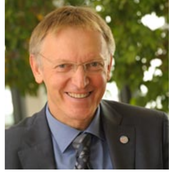
Janez Potočnik European Commissioner for Environment

The European Green Belt Initiative is an excellent example of how Member States, NGOs and other stakeholders can work together effectively. United by a common project: Preserving nature's most precious gift to humanity.