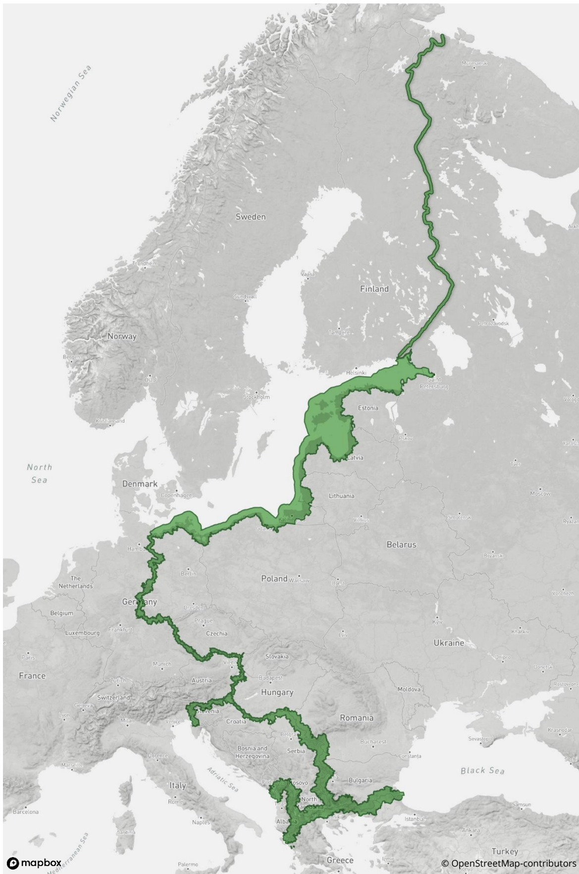
Figure 1: Indicative spatial reference area of the European Green Belt, defined by the European Green Belt Association (EGBA). The northern part of the reference area (Fennoscandia) is under preparation. For the BESTbelt project, the area is defined as 100 kilometres (km) of the border for Norway and Finland, and 5 km on the coastal water.